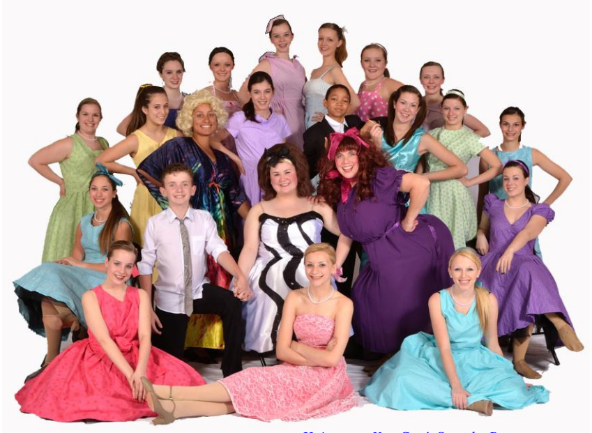
Hairspray: You Can't Stop the Beat

Broadway Bound, 551 Daniel Webster Highway, Merrimack, NH 03054 www.broadwayboundpac.com Email: broadwayboundpac@comcast.net Tel: (603) 429-8844 revised 10/7/2011